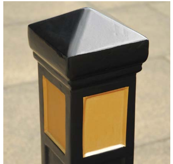
Stylish duracst polyurethane (PU) square bollard with peaked top.