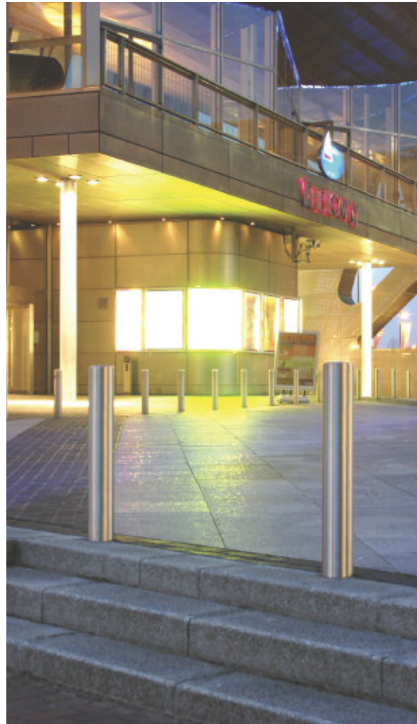
BX47 0089 75 bollards. Leisure Centre, Corwen, Denbighshire.