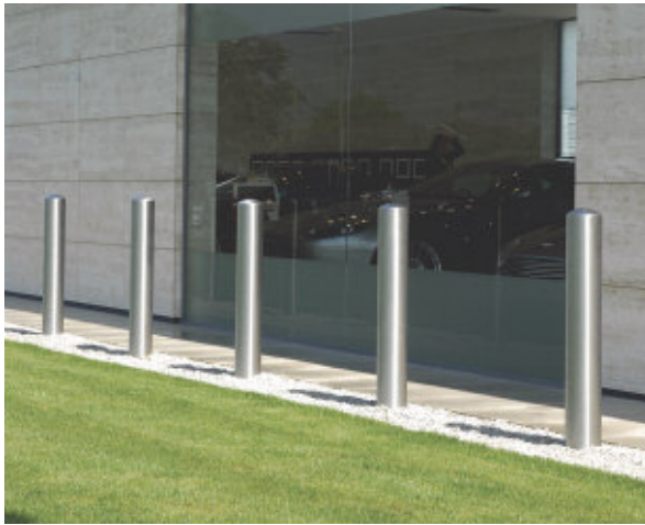
BX47 0101 00 bollards. Leisure Centre, Corwen, Denbighshire.