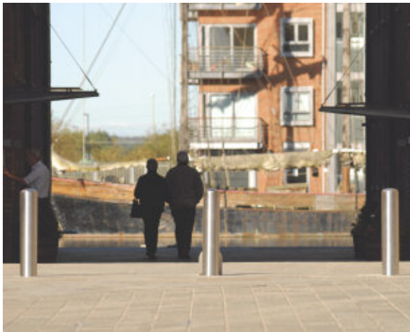
BX47 0140 75 bollards, one bollard showing removable fixing. Gloucester Docks.