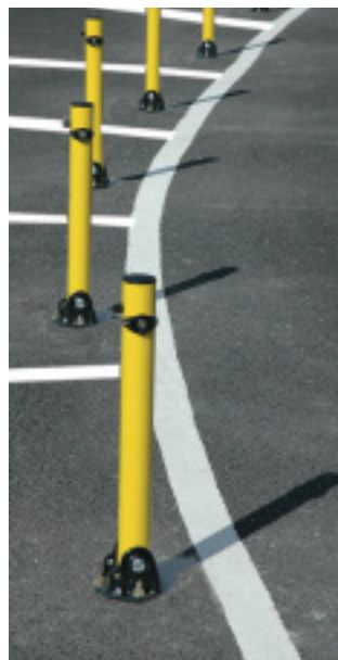
All Saints Road car park, Bridgewater.